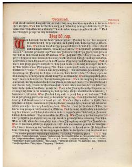
A page from the Tepl Codex

Various medieval versions of the New Testament which were based on the Old Latin contain the Comma. On such text is the Tepl codex, a late 14th century Middle High German compilation. 50 The verse appears in the version of the Apostle's Creed used by the Waldenses and Albigenses in the 12th century. The Augsburg manuscript (~1350 AD), the oldest complete New Testament in Middle High German, has the verse, and is unusual in that it says "Son or the Word" in v. 7. 51