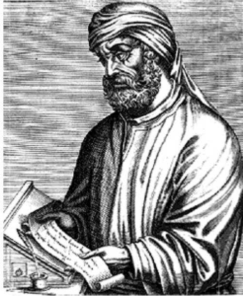
Tertullian of Carthage (ca. 160 – ca. 220 AD)