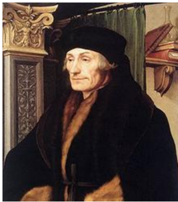
Desiderius Erasmus (1466-1536), a man about whom Critical Texters love to tell fabulous stories.

One piece of disinformation which has served to bolster the belief that Erasmus relied on little to no Greek manuscript support is the continued misrepresentation of the Greek witness which Erasmus himself said that he used. Modern scholars will claim that Erasmus included the Comma on the basis of the Codex Montfortianus, said to be the hastily prepared Greek codex which was produced to give him the pretext for including the verse. Erasmus states that he included the Comma into his third edition based upon the witness of the Codex Britannicus, a separate Greek codex. Scholars will attempt to equate Britannicus with Montfortianus, but this is not legitimate, as the rendering of I John 5:7-8 in Erasmus' edition is different from that found in Montfortianus. 22 Further, Montfortianus itself is not likely to be the supposed ringer which the Erasmus' Promise myth suggests, as it is dated by scholars such as Adam Clarke to the middle of the 13th century. 23